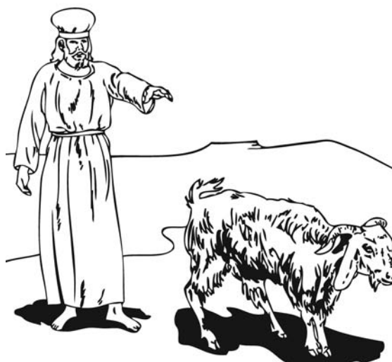
The scapegoat carries the sins of the people into the wilderness.

Instead, the scapegoat service is a removal service. The scapegoat is a way of removing sin and impurity (not being clean) from the camp of Israel, things that should not be there.