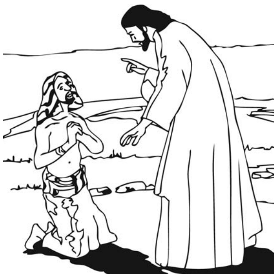
Jesus touches the leper, and the leprosy goes away!

Matthew tells us that the healing of the leper takes place as soon as Jesus comes down from the mountain. Right after delivering the Sermon on the Mount, Jesus has to deal with human 2 need in the valley. And the first challenge Jesus faces is leprosy. Leprosy is a symbol of our sinful human condition (the way things are right now). Jesus touches the leper, and the leprosy is gone! Such is the power of our Lord.