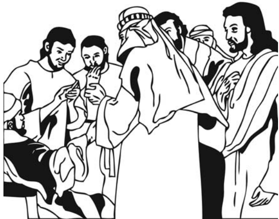
Jesus’ disciples watched Him heal the man with the withered hand.

were beaten down and helpless, like sheep without a shepherd” (Matthew 9:35, 36, NIV). Jesus said to His disciples, “The harvest is huge. But there are only a few workers.” Jesus then invited them to pray to the Lord of the harvest to send out workers (verses 37, 38, NIV).