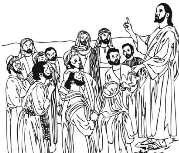
Jesus spent a lot of time training the Twelve.

Jesus appointed (chose) the Twelve so that they might be with Him and that He might send them out to preach. Matthew says that He “gave them authority (power) to drive out evil spirits and to heal every illness and sickness” (Matthew 10:1, NIV). Jesus chose them to supervise trained workers to help with caring for the large crowds that followed wherever He went (adapted from The SDA Bible Commentary , volume 5, page 322).