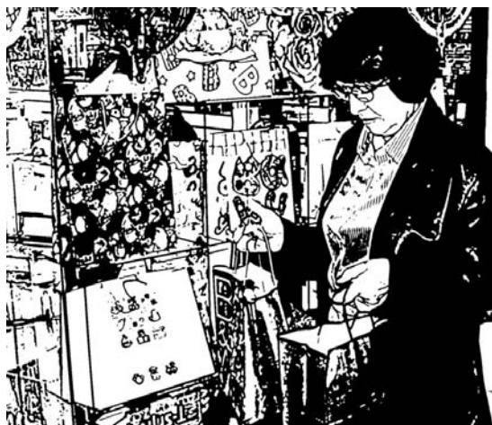
People often depend on something other than Jesus to make them happy.

we depend on our own strength. It also is possible to depend on other substitutes for God. When some people feel depressed (sad), they go shopping for something to make them happy. Others search for fame. When some people have difficulties with their spouse, they find someone else to give them love and excitement.