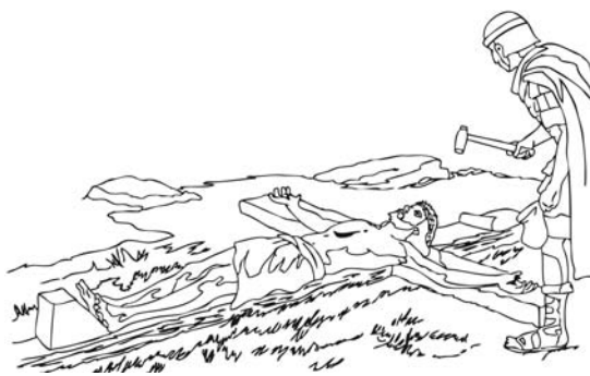
Jesus was "obedient to death—even death on a cross!" (Philippians 2:8).

Pray for wisdom from the Holy Spirit. Ask Him, "What rights am I holding right now that really might block my surrender to Jesus' will? How much am I willing to suffer so that I can serve others better?"