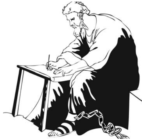
Paul wrote letters from prison to give hope to believers in Philippi.

must mean that we have to learn to rejoice at times when we do not feel like it.