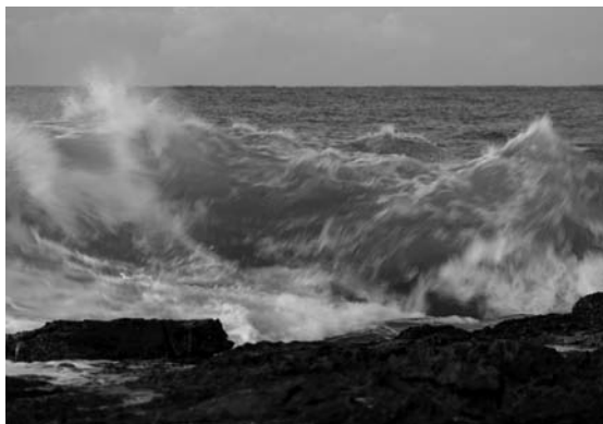
Jesus has thrown our sins to the bottom of the sea (Micah 7:19).

all who come to Him in faith (Romans 3:25, NIV). No matter who you are or what you have done, your sins can be forgiven by God. Just take hold of His promises of forgiveness for yourself.