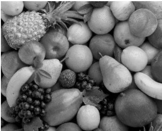
Fruits are one of God's wonderful gifts to us.

Jesus is the Creator of the universe. 12 He has filled the earth with His wonderful gifts, such as food. But sin has taken its terrible toll 13 on our world. So not everyone can enjoy these gifts. We may be very rich or very poor, but we have the promises of God that He will give us what we need.