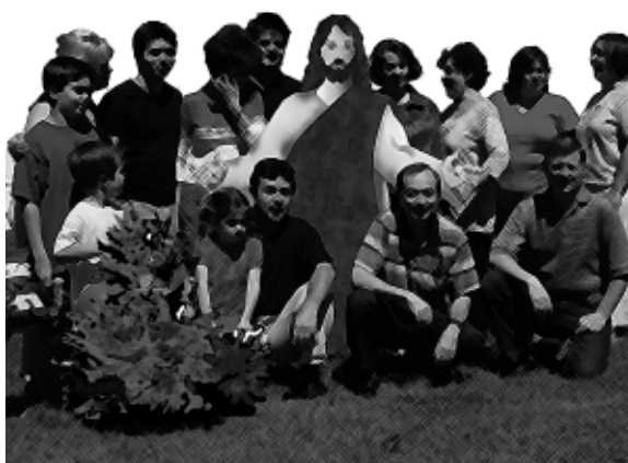
Close to Christ equals close to one another.

“In the same way, the closer we come to Christ, the nearer we shall be to one another.”—Adapted from Ellen G. White, The Adventist Home , p. 179.