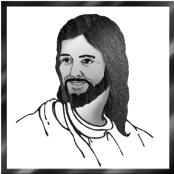
Keep your eyes on Jesus.

ly things not in earthly things. By faith, we must rise higher and still higher in receiving the graces of Christ. By thinking daily about His matchless love, we must grow more and more into His glorious image.”—Adapted from Ellen G. White, My Life Today , p. 105.