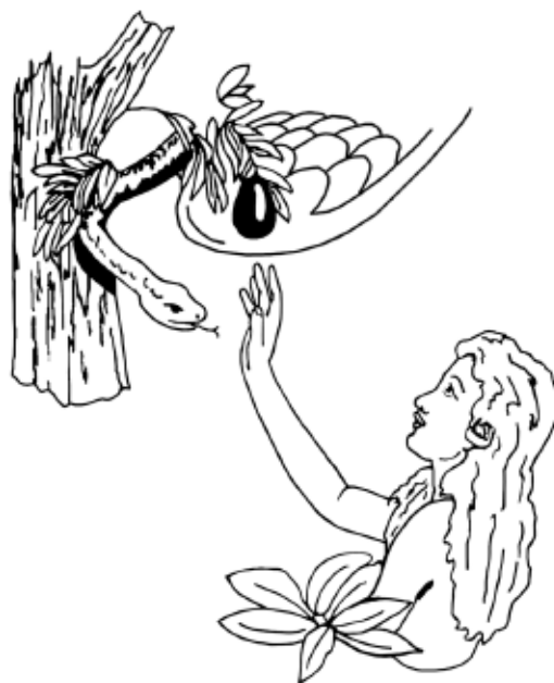
Satan is good at deceiving people.

Think about a time you had a victory in a spiritual battle and a time when you failed. What made the difference?