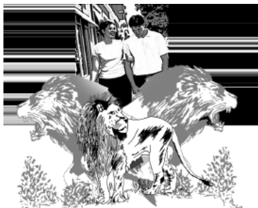
Satan is like a roaring lion looking for someone to eat.

3:8). He misrepresents (twists) Christ's way (Acts 13:10). He "deceives the whole world" (Revelation 12:9, NKJV). He fights against God's remnant church (Revelation 12:17, NKJV). He attacks the saints (Revelation 2:10). He can even appear as an angel of light (2 Corinthians 11:14). At the close of earth's history, he will lead all people who have not repented in a final battle to overthrow God's rule (2 Thessalonians 2:4-10). It is against this super-human being and his army of fallen angels that Christians are involved in a continuous war. "In every soul, two powers are struggling hard for the victory. Unbelief gathers its forces, led by Satan, to cut us from God, who is our strength. Faith gathers its forces, led by Christ, who is the Creator and Finisher of our faith. Hour by hour, in the sight of the heavenly universe, the war goes forward. This is a hand-to-hand fight. The great question is, who shall have the victory?" —Adapted from Ellen G. White, Sons and Daughters of God , p. 328.