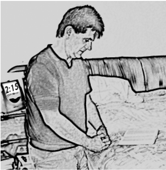
We can reach God at any time.

Paul is saying, “Do not worry about me or my troubles.” Think about the great news of what God has done for the world through Christ. The good news is far more important than anything I might be going through.