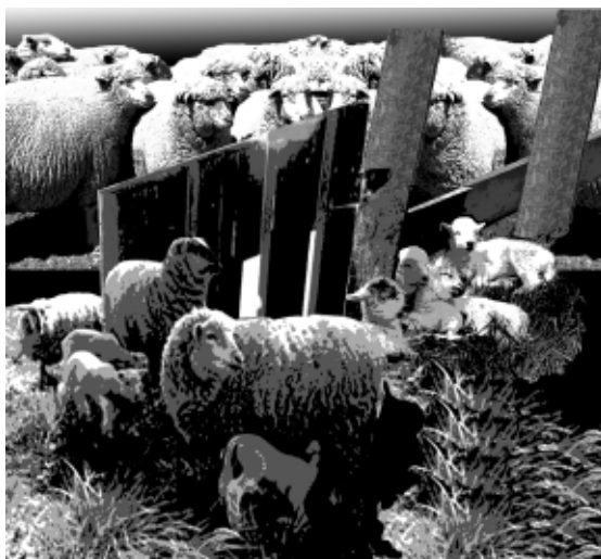
Jesus is the gate to God and His salvation (John 10:7-9).

In many Bible versions, Ephesians 3:13 begins with the word “wherefore.” In the Greek language, this word means “on account of” (because of). Paul is saying that on account of something, he does not want the Ephesians to worry about him. What is he talking about?