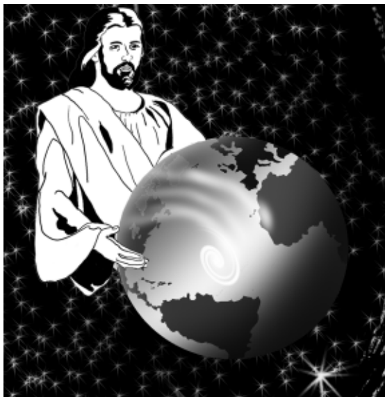
God made us. He also remakes us to be part of His church.

shows His wisdom to the universe (Ephesians 3:10).