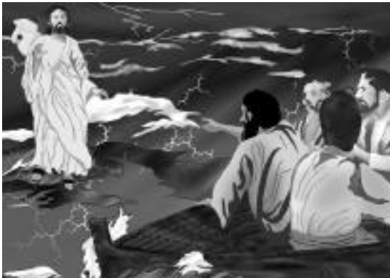
Jesus did many miracles while He lived on earth.

Through His earthly ministry (work), Jesus did many miracles. He healed people who were blind. He fed 5,000 people with two loaves of bread and five fish. He turned water into wine, and He cured people of leprosy. He walked on water, threw out demons, cured handicaps, stilled a storm, and raised people from death. There were so many other miracles Jesus did that the world itself could not hold the books “that should be written” about these miracles (John 21:25).