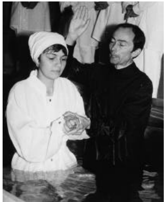
Baptism is a symbol of dying to self in Jesus and being raised to a new life in Him.

itually go through what Jesus went through. This is not death in a real sense, but a death of self, a death to sin, a death to living for the flesh. The same power that brought Jesus from the grave can bring us into the “newness of life.” This is a life where we are no longer under the control of sin and of the flesh. This is a very important part of the whole Christian experience.