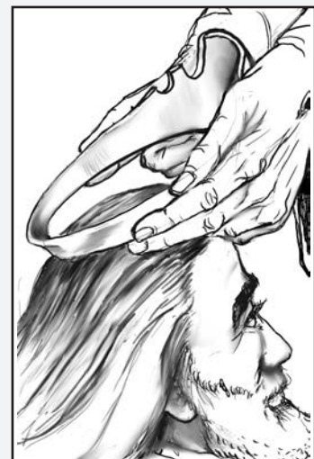
Paul knows that he will get a crown from God someday.

When our life is hard, we often want to close our eyes in death. Nobody wants to suffer. Make a picture in your mind: you are sleeping. Then Jesus wakes you up! How does this wonderful Bible promise help us understand what Paul was saying in Philippians 1:21–24?