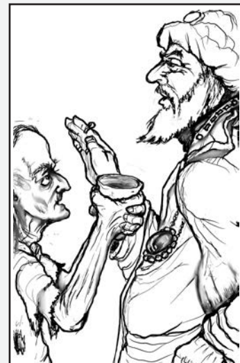
The picture story about the rich man and Lazarus shows us two men who are very different from each other.

Read Jesus' words in Luke 16:31. What does Jesus say about how much the Bible should control our lives?