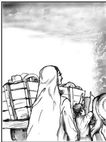
The Israelites followed God in the cloud through the hot desert for three days. There was no water anywhere.

Then, a few days later, God gives His people another water test. This time the tall cloud stops where there is no water at all (Exodus 17:1).