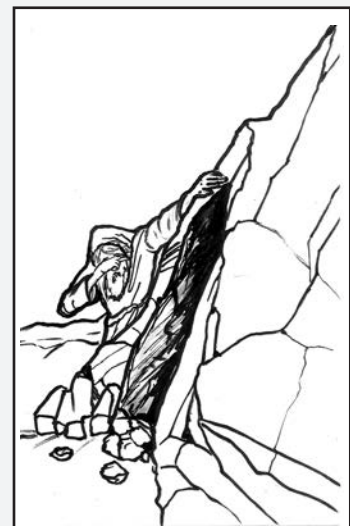
In Genesis 23, we read that Sarah dies and is buried.

Read Genesis 23:6. What does this Bible verse tell us about how much people respected Abraham? Why is the respect and honor that other people showed Abraham so important to the plan that God had for Abraham and his life?