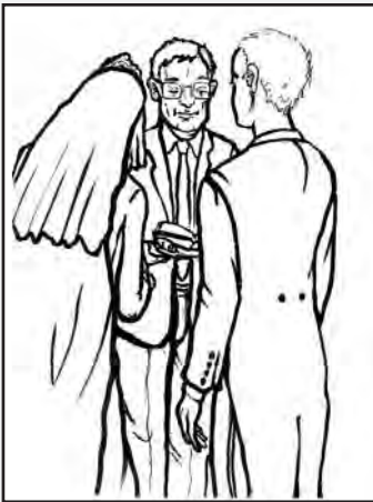
Paul says that Christians should honor marriage.

What can we do to protect ourselves against sex sins and the love for money?