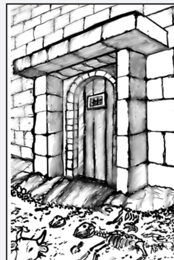
The place outside the gate was the worst part of the whole Israelite camp.

What does it mean to you to go to Jesus “outside the camp”? How do we join with Jesus to suffer His shame?