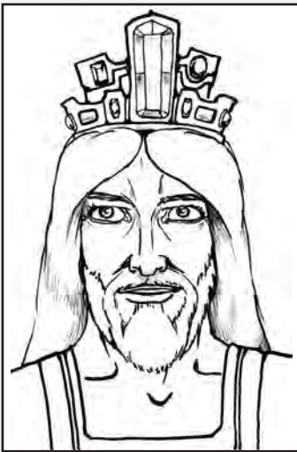
Jesus also is our King.

READ FOR THIS WEEK'S LESSON: Hebrews 12:22–24; Daniel 7:9, 10, 13–22; Hebrews 12:26, 27; Psalm 15:5; Hebrews 13:15, 16.