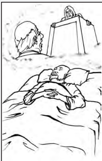
In a dream, Daniel saw the court in heaven (Daniel 7).

Read about the celebration in Hebrews 12:23. If these verses really show us a celebration, why is God the Judge there? How can a judge be part of a celebration or a reason for it? (Read also Daniel 7:9, 10, 13–22 for the answer.)