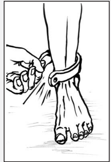
God commanded His people to free the slaves in the 7th year.

The way we keep the Sabbath should change how we live our lives the other six days of the week. Put God's kingdom first. God knows what you need. " 'Then he will give you all these other things you need' " (Matthew 6:33, ERV).