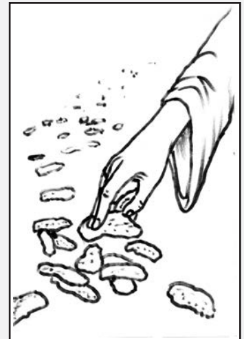
Every Friday, double manna fell on the ground.

But this miracle has another wonderful part. Every Friday, double manna fell on the ground. God told His people to collect the extra manna. He gave them the extra manna for the Sabbath. The extra manna shows God's loving favor to His people. This miracle also shows God's people that He will give them everything they need. This miracle teaches God's people to trust Him. They do not need to worry about what they will eat tomorrow. Now they can enjoy their rest more fully on the Sabbath.