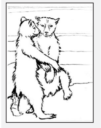
We should thank God every day for all His gifts from nature.

What do you like the most about nature? What does the beauty in nature tell you about the Lord?