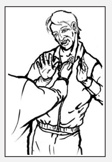
God gave humans the freedom to choose good or evil.