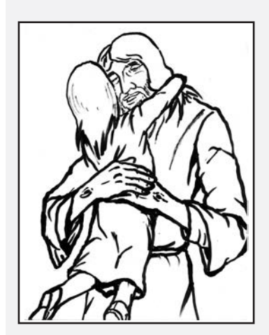
God never stops loving humans.

Since that time, people continue to sin. Often, they are not fair or kind. They hurt each other. They fight against God. But God never stops loving humans. He made a plan to save us. He also gave us a part in His plan to help Him save other people too. Wow! We serve a wonderful God!