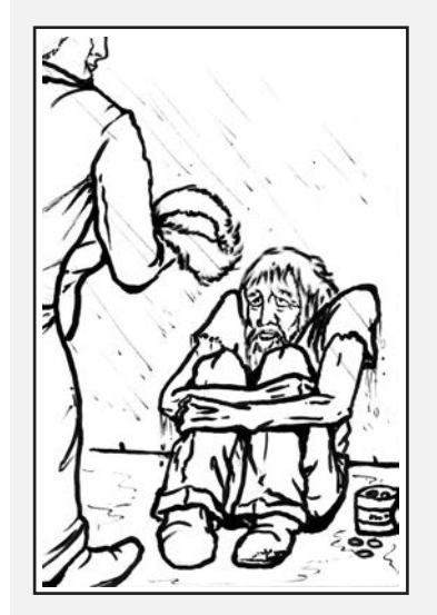
It is our "job to take care of [our] brother" (Genesis 4:9, ICB).

God made us. That is why He asks us to give Him our hearts and lives. He also asks us to worship Him, work for Him, and care for other people. Maybe at times it can be hard to love people. But even so, it is our "job to take care of [our] brother" (Genesis 4:9, ICB).