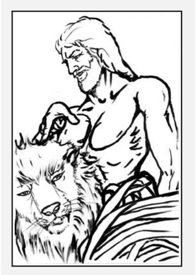
God gave Adam the job of naming all the animals and birds.

The earth belongs to God (read Psalm 24:1). He continues to ask us to take care of everything He gives us. But we live on an earth hurt by sin. So, it is even more important for us to be good managers.