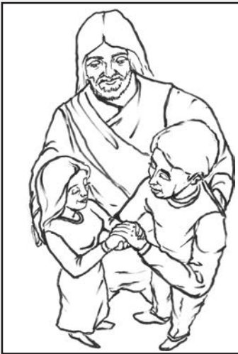
The Christian partner brings Jesus into the home.

What advice does the New Testament give Christians who are married to people who do not believe in God? Read 1 Corinthians 7:12–15 and 1 Peter 3:1, 2 for the answer.