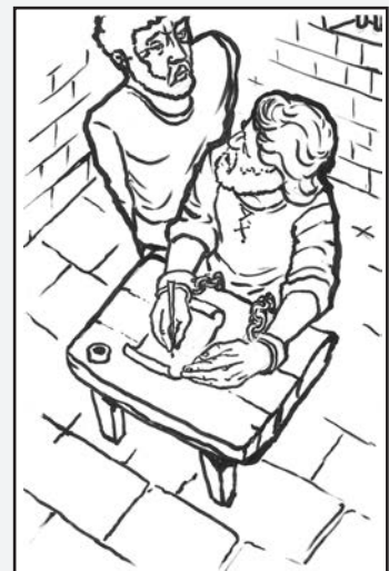
In his letter to Philemon, Paul works hard to heal a broken connection between his friend and the runaway slave, Onesimus.

What important rules does this story give us about how to heal our broken friendships and connections with other people?