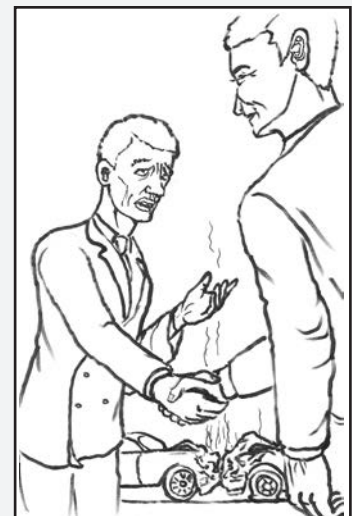
Forgiveness is a choice that we make.

Forgiveness is the same as freeing people from the punishment that they earned for the wrong they did. That is exactly what Jesus did for us on the cross. We can forgive people because God forgives us. We can love people because God loves us. Forgiveness is a choice we make.