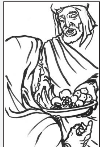
The seven men took over the work of serving food to widows.

First, the apostles listened very carefully to the Greek-speaking believers. Then the apostles asked these believers what they thought should be done. Next, the apostles asked the group to choose seven men to help serve food to the widows. So, the Greek-speaking believers chose seven men. All seven men spoke Greek. They also were “‘respected and . . . full of the Holy Spirit and wisdom’” (Acts 6:3, NLV). Before the church chose the seven men to help the apostles, the apostles had to preach the truth and give food to widows. But now part of the apostles' work was given to the seven men. The seven men took over the work of serving food to widows. In Acts, the same Greek word is used for both the preaching that the apostles did (Acts 6:4) and the work the seven men did serving food to the widows (Acts 6:1). This same word, “ diakonia ,” means service. It shows us that both jobs were equal and important in God's eyes.