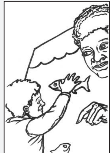
Jesus told His followers to baptize people and to teach.

What are your spiritual gifts? How are you using your gifts to bring peace to your local church?