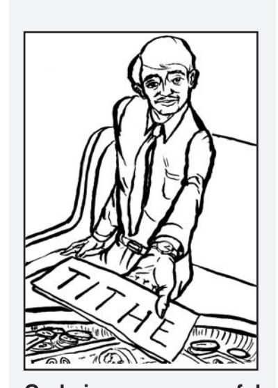
God gives us a powerful "cure" to help us not to be dishonest and selfish. What does God ask us to do to guard against these sins? God asks us to pay tithe.

How can paying tithe help you remember who really owns all that you have? Why is it important never to forget who owns all that belongs to us?