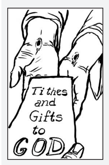
We cannot hold back from God our tithe. If we do, we cannot expect Him to give us the things we ask from Him.

There is a connection between a new spiritual life and paying tithe. What happens if we do not pay tithe? Then our experience of a new spiritual life becomes lukewarm. Our spiritual lives also will have no power. But God gives us new spiritual lives and improves the way we live. These changes are really His way of asking us to make a promise to change. Paying tithe is part of that promise. So, we cannot hold back from God our tithe. If we do, we cannot expect Him to give us the things we ask from Him.