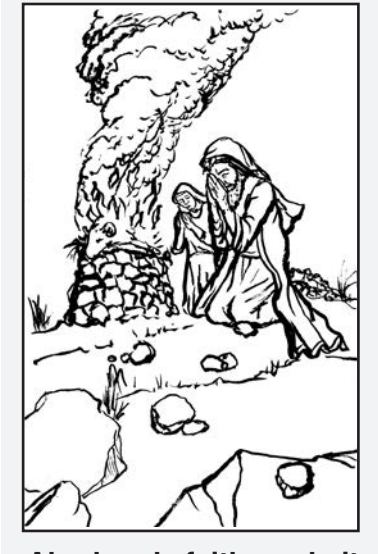
Abraham's faith made it possible for him to do what he did on Mount Moriah.

How has your faith grown and become stronger over time? Or maybe you feel your faith is weak. Why is it weak?