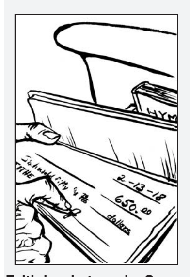
Faith is what we do. So, we show our faith when we take 10% of our paychecks and give it back to God.

Have you experienced the rewards of paying tithe? If yes, how? How has paying tithe helped your faith to grow?