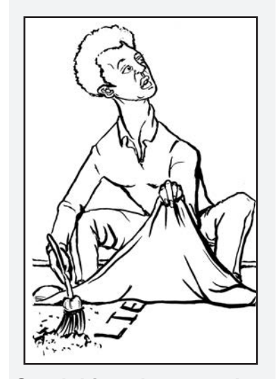
Good things happen when we are honest. Then we never need to worry about being caught in a lie or having to cover it up.

In this week's lesson, we will study the topic of being honest with our money and paying tithe. Paying tithe is giving to God 10% of all the money we get. We will study why paying tithe to God is very important to our work as managers of everything that God trusts us with.