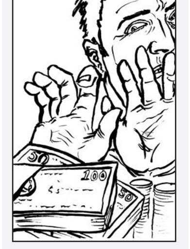
Paying tithe to God shows our faith in God. It shows we refuse to make riches the most important thing in our lives.

"A selfish spirit stops men from giving back to God the gifts of money that belong to Him. God made a special agreement with men. He promised what He would do if they agreed always to give back to Him 10% of all the money they got. This money is meant to build up Jesus' kingdom. What happens when God's people separate this tithe money for Him from all the money they earn? Then God promises to bless them in a powerful way. He will give them so much that there will not be room for His gifts. But what if men hold back from God what belongs to Him? Then the Lord says clearly, 'A curse is on you because the whole nation has robbed me' [Malachi 3:9, ICB]."—Ellen G. White, Counsels [Advice] on Stewardship [Taking care of the gifts God gives us], page 77, adapted.