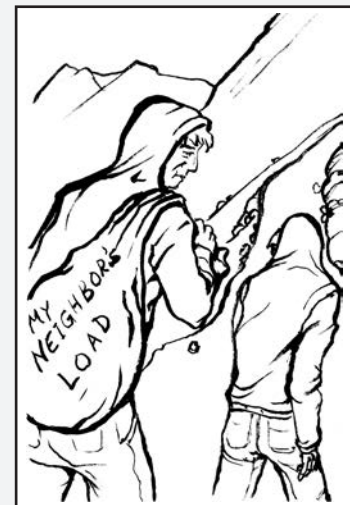
God asks us to carry the loads of others.

What stops you from asking others for help? Is it a proud heart? Is it feeling ashamed of needing help? Or is it not being able to trust? Or is it that you feel you need no help? Why not find someone you trust and ask this person to help carry your load?