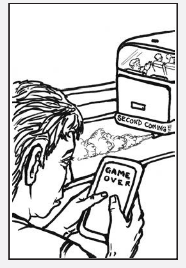
The danger we face is not in setting dates for Christ's soon return. The real danger comes the longer we remain here on earth.

How much does the Second Coming affect you in your daily life and thinking? What does your answer say to you about your life and faith?