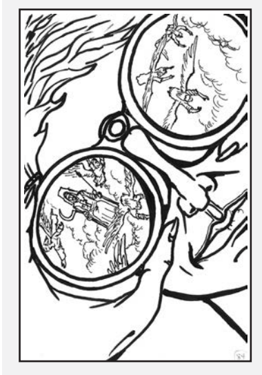
"Those who are watching for the Lord are making their souls pure by obeying the truth."—Adapted from Ellen G. White, The Desire of Ages , page 634.