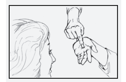
The first act of wisdom is "to listen." This is because wisdom comes from outside us.

Emotions play an important part in our basic life as humans. So, they cannot and should not be forgotten in our relationship with God. How do we learn the proper place and value of emotions (strong feelings) in our spiritual life? How have your emotions guided you correctly or incorrectly? What have you learned from those experiences?