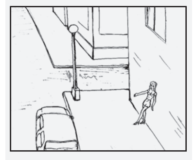
Avoid the place where the "temptress" stays (Proverbs 5:1).

Read 1 Corinthians 10:13. With this promise before you, what useful steps can you take to protect yourself from the desires that might be stirring up in you?