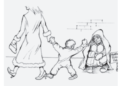
Wisdom is not what we know but how we live.

Read James 1:6 again. We must ask in faith, not doubting. It can be hard sometimes. Who does not, sometimes, struggle with doubt? When that happens, it is important to pray and to start thinking about all the reasons we have for our faith: the story of Jesus, the prophecies (special messages from God) in the Bible, and our own personal experiences. How could doing this help us to work through doubt that we might have sometimes?