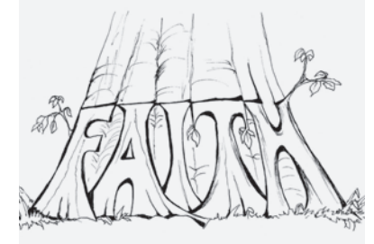
It's not how much faith you have but whether it is alive and growing.

What are all the reasons you have for trusting in God and His promises and living by faith? Think deeply about them, and your faith will only increase.