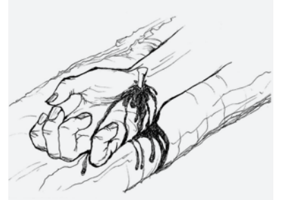
Christ was not nailed to the cross to make the Father love us. He loved us already.

How are we, each of us in our own way, like the prodigal son? In what ways have you experienced what he went through?