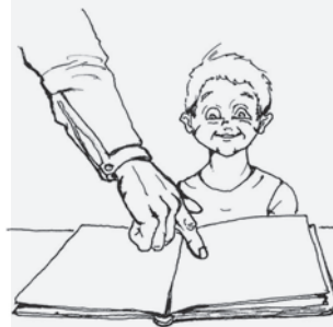
Paul pictures the law as a schoolmaster or tutor.

Read carefully Galatians 3:21. What does it say that should end forever any idea that we can be saved by obedience to the law? Why is this such good news? Bring your answer to class on Sabbath.