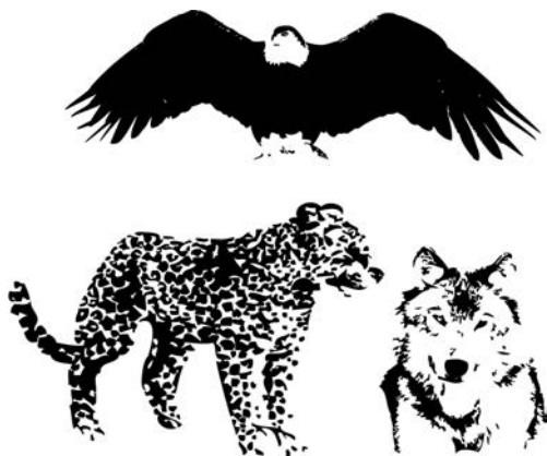
Babylon's army is compared to a leopard, wolf, and eagle.