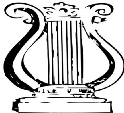
Habakkuk's hymn celebrates God's glory and power.

Think about God's past leading in your life. How does this help you to learn to trust Him and His goodness, no matter what the near future brings? Why is it always so important for us to look to the final and eternal future that awaits us?