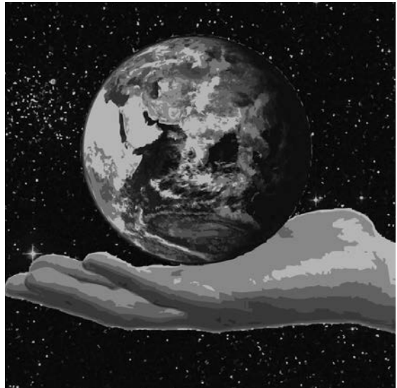
The world belongs to God.

More so, we are God's by Creation and by Redemption. 1 Redemption is a wonderful gift from God. But human life has been greatly damaged through sin. And it will end in death. This robs life of all meaning and purpose. So, life as it now is for us is not all that great. Our only hope is the wonderful promise of Redemption. This is the only thing that can make things "right" again. So, we are Christ's by Creation and by Redemption.