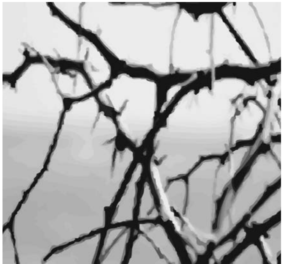
All creation is spoiled by the curse of sin.

Read Romans 8:19–22. These are difficult verses to understand. But how are they connected with what we have studied today? More important, what hope can we get from them?