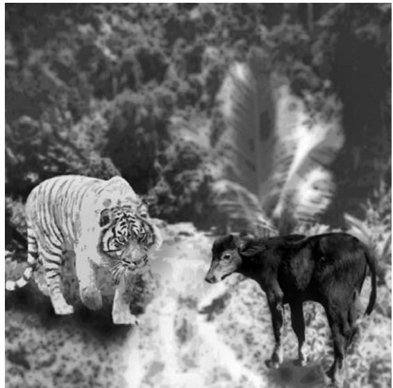
Nature can give us wrong ideas about God because it is so damaged by sin.

What damage has Satan done to your own life? Why are the Cross and the promises found in it your only hope?