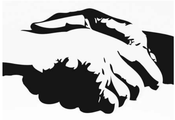
Goals and plans go hand in hand.

Every church should be aware of the need to set goals and follow them. It is important that as many people as possible be involved in all parts of the planning. In this way, they, too, feel they are involved. If this does not happen, then the long-term plans will cause a chosen few to work too hard to fulfill those plans. Because of this, success will not come.