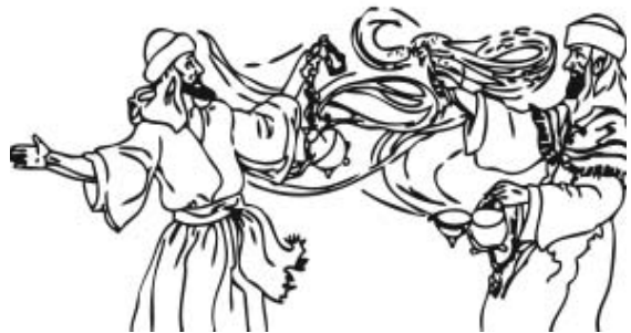
Nadab and Abihu handled the holy things of God as though they were common things.

“To handle holy things as we would common things is an insult to God. The things that God has set apart for giving light to this world are holy. Those who are connected with the work of God are not to depend on their own foolish wisdom. Instead, they always should depend on the wisdom of God. If they do not, they will be in danger of placing holy and common things on the same level. In this way, they might separate themselves from God.”—Adapted from Ellen G. White, Evangelism , 20 page 639.