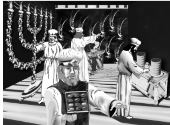
The Lord dedicated the Levites to Aaron and his sons to help with the worship of God and the care of the tabernacle.

out among the tribes. Some became teaching Levites (2 Chronicles 17:7–9). Others became judges (2 Chronicles 19:8–11). They taught the people in the ways of God.