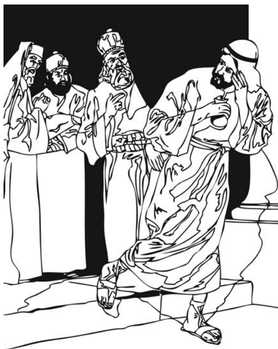
Jesus was betrayed into the hands of sinners.

Matthew 26:45, 46 says that Jesus was handed over into the hands of sinners. The verb suggests the idea that something owned is passed from one to another. This was when Jesus was to experience total separation