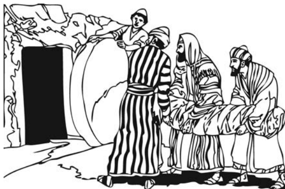
Jesus' death meant that the perfect sacrifice for sin had once and for all been offered.

Testament ended. At the moment Jesus died, the veil (curtain) of the temple was torn apart, from top to bottom (Matthew 27:51; Mark 15:38). It showed that God could be reached only through the sacrifice and person of His beloved Son.