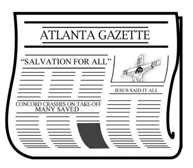
The good news about Jesus was for all people, not just for the Jews.

The book of Acts is full of surprising events. Saul, the attacker, becomes Paul, the missionary.<sup>4</sup> The gospel of salvation<sup>5</sup> becomes good news for all, not just for the Jews. And now Paul works for a church that exists because of his earlier efforts against the church.