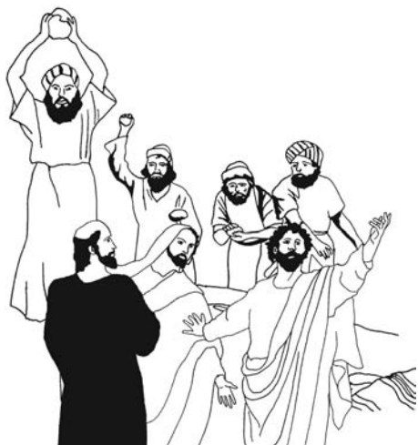
People attacked the disciples for believing Jesus rose from the dead.

From what you know about the life of Jesus' early followers, why does inventing the story of Jesus' resurrection not make any sense? Read Luke 21:16, 17; John 16:2.