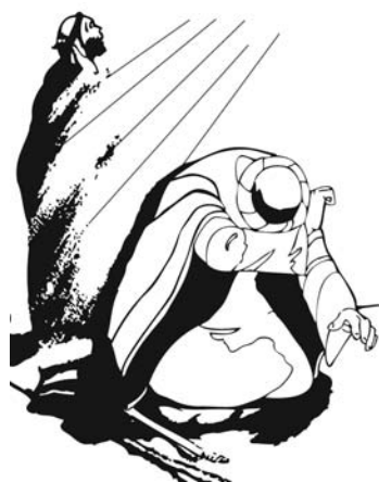
Jesus spoke to Paul on the road to Damascus.

Paul is telling people that after Jesus' resurrection, He appeared to more than five hundred people, "most of whom are still living." Paul has so much faith in Jesus' resurrection that he invites people to talk to those among the 500 who are still alive. Another reason Paul was certain about Jesus' resurrection was because he, himself, had seen the risen Jesus (Acts 9:1-8).