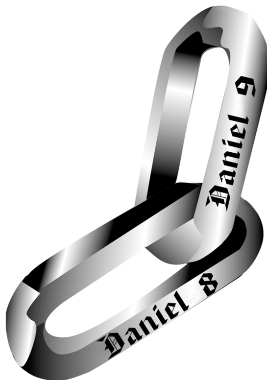
Daniel 8 and Daniel 9 are connected to each other.

Review the connection between Daniel 8 and Daniel 9. Be able to defend the position that Daniel 8 and Daniel 9 are tied together.