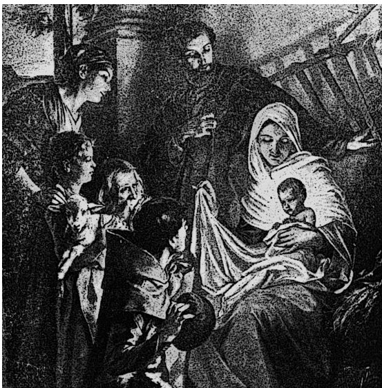
Jesus was given life through God, the Holy Spirit.

Character traits 5 of the Holy Spirit include truth (John 16:13), life (Romans 8:2), and omnipotence 6 (1 Corinthians 2:10, 11). All of these traits are connected with the Godhead. Jesus says blasphemy 7 spoken against Him can be forgiven. But blasphemy spoken against the Holy Spirit cannot be forgiven (Matthew 12:31, 32). This does not make much sense if the Holy Spirit were not God. Jesus was given life in Mary's womb through the Holy Spirit (Matthew 1:20). This is also difficult to understand if the Holy Spirit were not truly God. (Also read Genesis 1:2.)