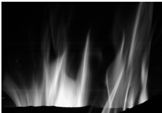
Fire is a symbol for the Holy Spirit.

“He” when speaking of the Holy Spirit. The use of “it” for the Holy Spirit in the original Greek and in English has become popular for symbols of the Holy Spirit such as fire, wind, and oil.