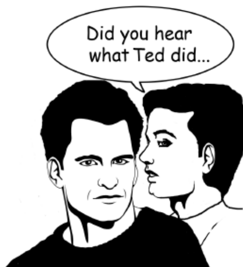
Gossip has no place in the new life Christ gives us.

4. Guard your tongue. Be edifying (positive) in speech (Ephesians 4:29). Words are powerful tools. Words can be a great blessing. But Paul warns against corrupt talk. The Greek word for corrupt also means rotten. Rottenness, swearing, and gossip have no place in our speech. A Christian’s speech should always be encouraging.