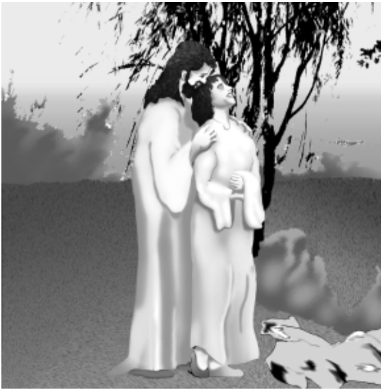
Put away the old life. Put on the new life Christ gives us.

When people accept Christ, they put off their old lifestyle. But putting off the old lifestyle is not enough. Christianity is not a religion of negatives. Christianity expects the believer to rise to a higher standard of moral and spiritual living. So Paul says: “Be renewed in the spirit of your mind and . . . put on the new man” (Ephesians 4:23, 24, NKJV).