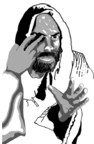
Jesus' life shows us how much God loves us.

What things might you have done in the past twenty-four hours that would have made the Holy Spirit sad? Were these things unavoidable? If they were not unavoidable, why did you do them?