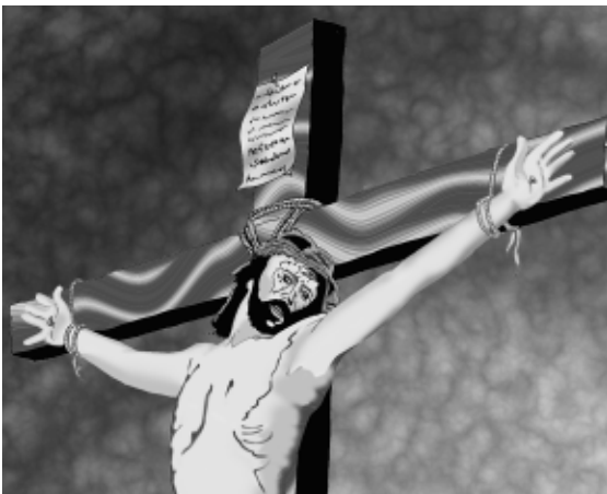
The lowest level of humbleness.

up are celebrated by the giving of the gifts to church members whom Christ has rescued from Satan. Satan is the prince of darkness. By Christ's victory over Satan, and by His going up "higher than all the heavens" (Ephesians 4:10, NIV), Christ fills all things. He is Lord of the universe. But He is still closely tied with the church on earth and fills the church with His gifts.