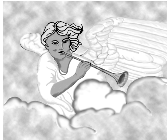
The first angel’s message is about worshipping God on the Sabbath day, because He is our Creator.

1 and 2 help you understand the part the Sabbath plays in the first angel’s message of Revelation 14:6, 7?