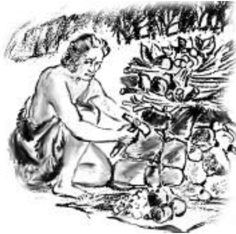
Cain tried to earn salvation with his "good works."

The story of Cain and Abel is an example of the sharp difference between people who accept Jesus' salvation by faith and people who try to earn salvation with "good works." But people who do not agree with salvation by faith in Jesus alone, without the works of the law (Romans 3:28; Galatians 2:16; Galatians 3:11), often say that teaching salvation by faith in Jesus alone leads to sin. They argue that if good works cannot save us, why should we do good things (Romans 6:1, 15)?