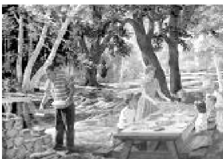
Every good gift comes from God (James 1:17).

What are the things about Daniel’s God that the king admits? Daniel 6:25-27. Compare 7 what the king says with the following verses. Psalm 59:1, 2; Acts 2:22; Galatians 1:4; 1 Timothy 4:9, 10; Hebrews 2:4; Hebrews 10:31; James 1:17. How correct a picture of God did the king give?