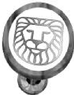
A signet ring.

The lions' den was probably an underground pit (hole in the ground) with walls and an opening at the top. Guilty people were lowered or thrown into the pit from above. In Daniel's case, a large stone was rolled over the opening and sealed with the king's signet ring. 4 The seal was a guarantee to Daniel's enemies that no one would try to save him. The seal was also a guarantee to the king that Daniel would not be harmed by a person because the king had hoped that Daniel's God would protect him from the lions.