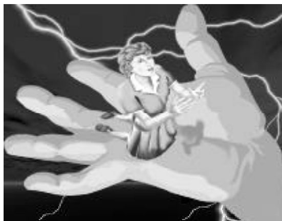
Our lives are in God’s hands.

SUMMARY: Belshazzar knew well the experiences of his grandfather Nebuchadnezzar. But Belshazzar chose to rebel against the God of heaven. It is sad when the wisdom of parents and grandparents cannot be passed on to their children. A person’s eternal 12 life depends on his or her own choice.