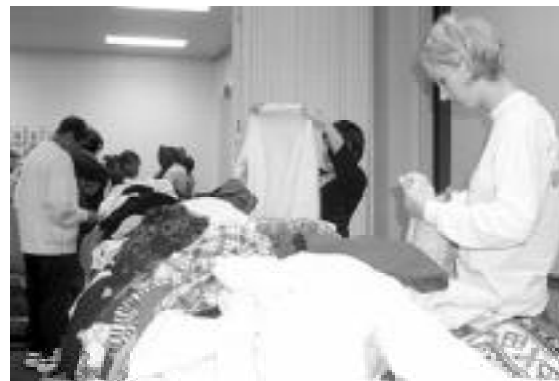
This is the kind of fasting God wants us to do!

Isaiah 58:1-8 shows the difference between religion and being a true follower of Jesus. Describe that difference in your own words. The people of Israel believed that their religious services showed they were really following God. How might we be tempted to believe that our religious services show that we really are following God?