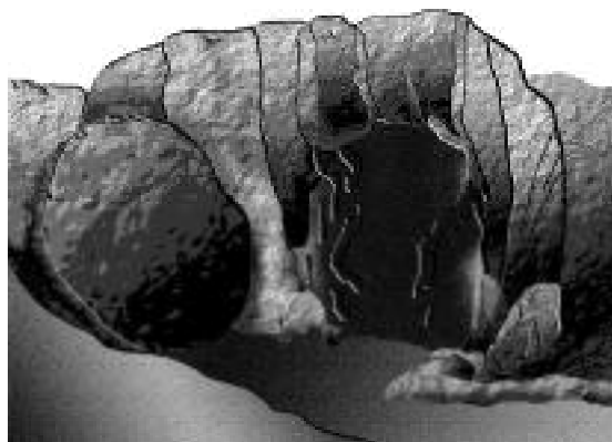
Jesus used the story of Jonah to teach the people about His resurrection.

Look up the groups of verses below. What does each group say that helps explain why Jesus would use the Jonah story as a “sign” of His own experience?