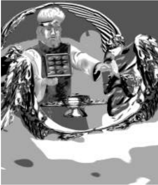
The high priest enters the Most Holy Place to cleanse it with blood.

work of the earthly sanctuary. Hebrews also uses symbols from the yearly work of the earthly sanctuary. The yearly work is called the Day of Atonement. The Day of Atonement was the last sanctuary service of the year.