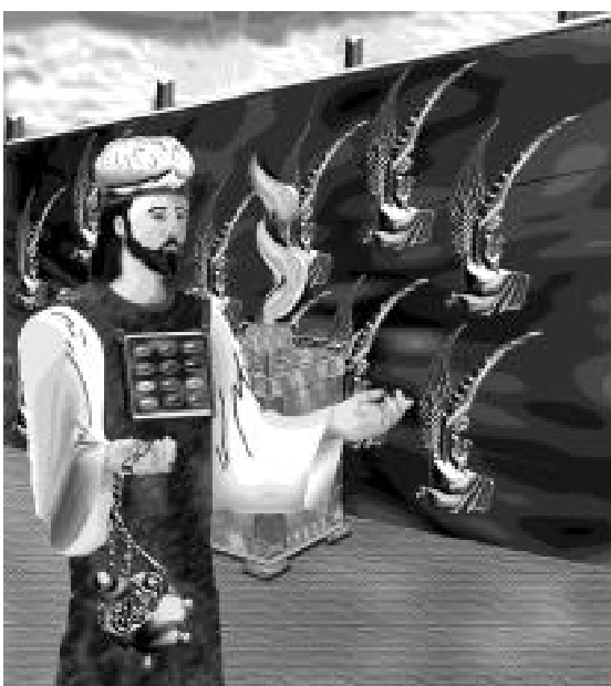
We can go to God, because Jesus is our High Priest in heaven.

We must remember why Paul wrote to the Hebrew Christians: He is telling them not to go back to their old ways. The new way offers them something much better. The new way can do what the old way never could. The new way offers you the opportunity to come to God as you could never come to Him before. That is because you can now come to God through Jesus.