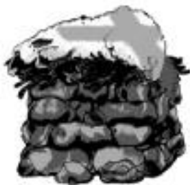
Sacrificing a lamb to represent Jesus’ death for our sins was part of the daily sanctuary service.

Using the earthly sanctuary as an example, Paul showed a difference between the ministry in the first room of the sanctuary (the Holy Place) and the ministry in the second room of the sanctuary (the Most Holy Place). In the earthly sanctuary, the priests and the high priest offered daily sacrifices to atone for 4 the sins of the people. Once a year in the Most Holy Place, the high priest made final atonement 5 for the sanctuary (Leviticus 16). The daily services seemed to deal with the sin of individuals. The yearly services dealt with Israel as a nation.