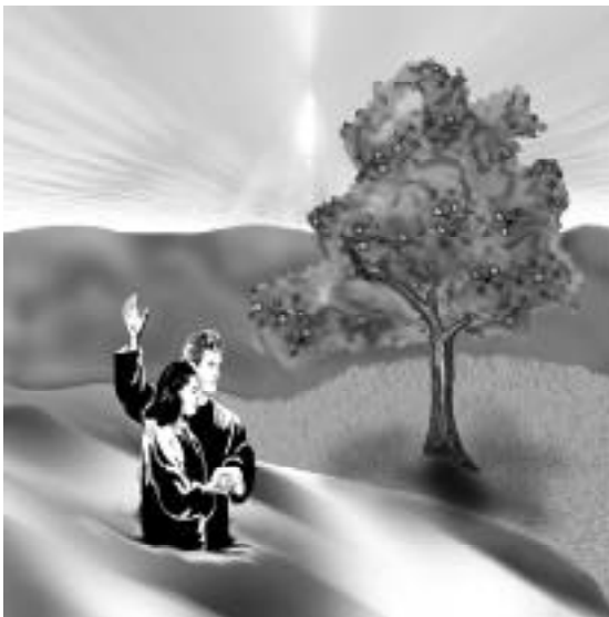
Baptism symbolizes that we die to self and arise to a new life in Jesus.

What does it mean to lose our life for Jesus' sake? Why must we "die" in order to serve Jesus? Also read Luke 9:23; Romans 6:1-8; Galatians 2:20; Colossians 2:13, 20; 2 Timothy 2:11.